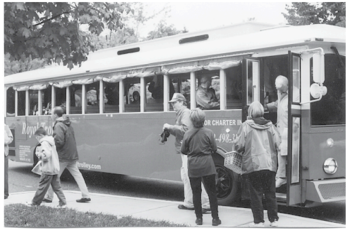
Architectural trolley tours proved very popular

verheard said by a small child to her father as they were leaving the fair: "Thank you, Daddy, for a wonderful day!"