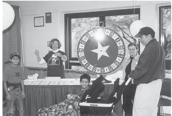
Two "Wheel of History" prize winners