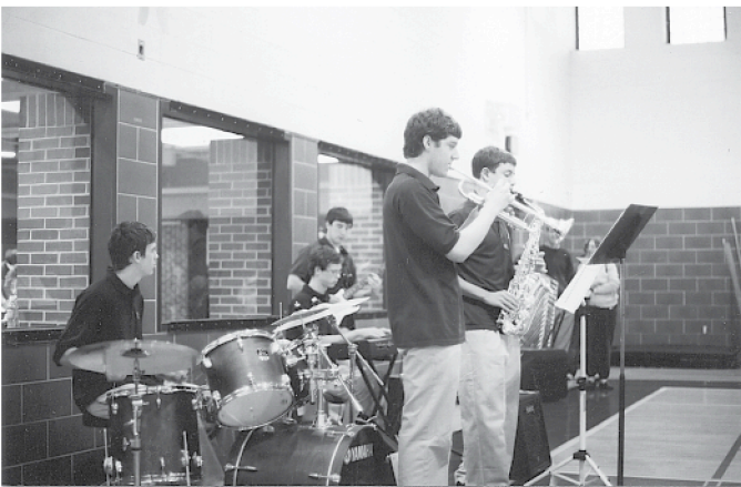
The B.C.C. Jazz Ensemble had the crowd jumpin'