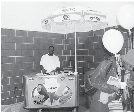
The most popular guy at the fair—FREE ice cream