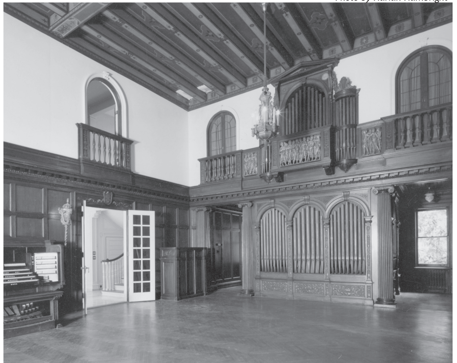
Music room at the Corby Mansion where tea was served during the house tours