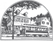
Chevy Chase Historical Society

The Chevy Chase Historical Society's longtime logo – that familiar streetcar rolling down a tree lined street past a pair of classic Chevy Chase homes – has had a facelift.