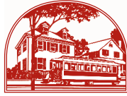
CHEVY CHASE HISTORICAL SOCIETY