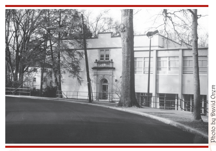
The graceful school building as it appeared in 1993

Generations of Chevy Chase school children have flowed through the halls of Chevy Chase Elementary School on Rosemary Circle and have fond memories of their days at the school some still affectionately call "Rosemary."