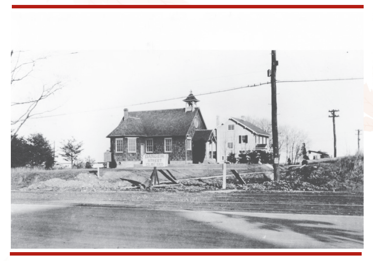
1912 photograph of the shingle church where the Chevy Chase Methodist congregation first worshipped

Interviewer: Well, that's not the same building, then. They've redone [it].