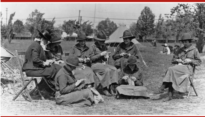
NSS students making Red Cross sponges

The school's main objective was "to train women to be of real national service along the lines to which they can best serve and ... give impetus to the movement for national service among young women". President Woodrow Wilson presided over the opening ceremonies with the rallying cry, "The nation is awake!"