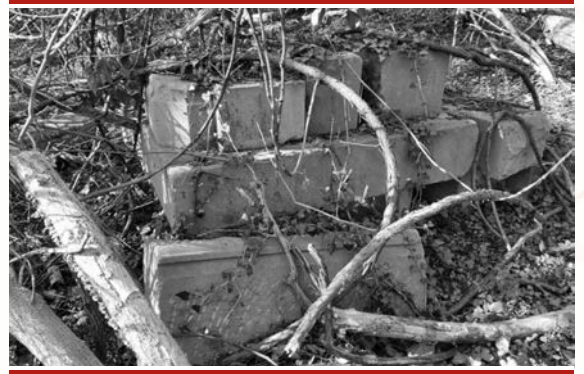
Mysterious cut stones piled along the Capital Crescent Trail

Just 45 feet short of the fence at the Columbia Country Club, approximately 40 cut stones have been abandoned. Coated with moss and strangled in vines, they have clearly been there for some time. The majority are heaped in a high and weighty pile, others randomly scattered nearby. Some bear the distinctive marks of a mason-carver. One is a triangle. Most are blocks of differing sizes. The stones lie close to what is left of a passing track on the B & O's Georgetown Branch line, which ceased operation in 1989.