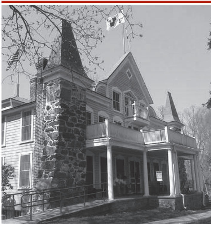
Clara Barton house at National Historic Site