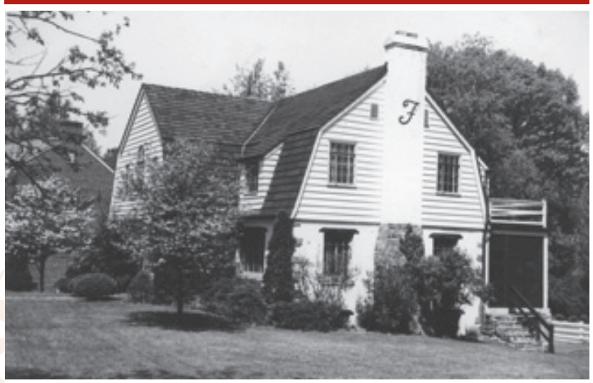
This house, located at 3407 Thornapple Street, was built in 1937 by the Fowlers. Bertha loved to garden, and shared many flowers with her next door neighbors.